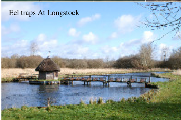
Eel traps At Longstock