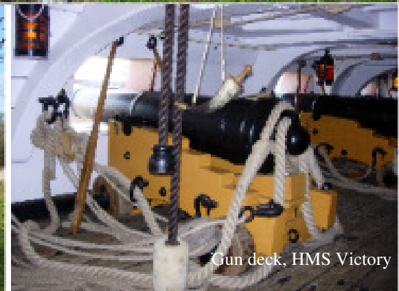
Gun deck, HMS Victory

Just a few of the locations within an hour of Forest Edge