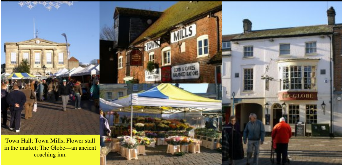
Town Hall; Town Mills; Flower stall in the market; The Globe—an ancient coaching inn.

The Andover Museum of the Iron Age (Free entrance) is well worth a visit.