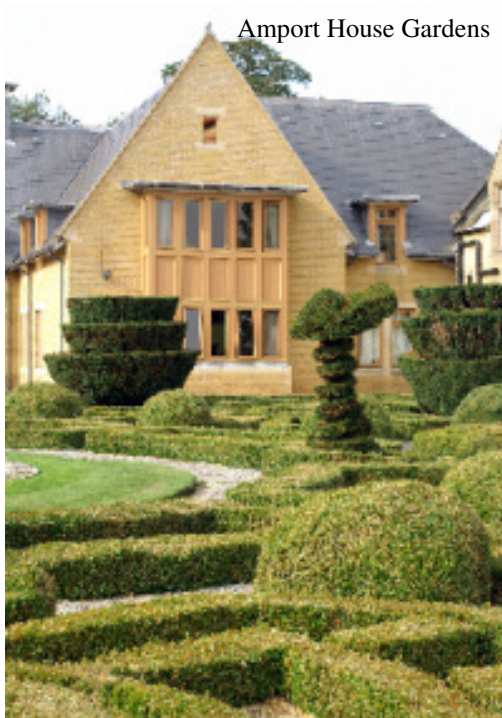
Amport House Gardens